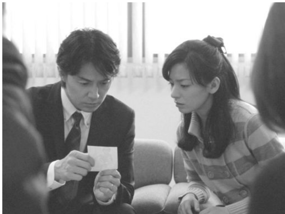
Masaharu Fukuyama and Machiko Ono star in Like Father, Like Son , in which two families are thrown into crisis when they discover that their babies were switched at birth.

As always, our many volunteer members form the heart of the Film Society. Did you know that more than two dozen dedicated volunteers work (largely) behind the scenes to keep the wheels of SCFS turning, making possible the showing of the delightful fare that we all enjoy?