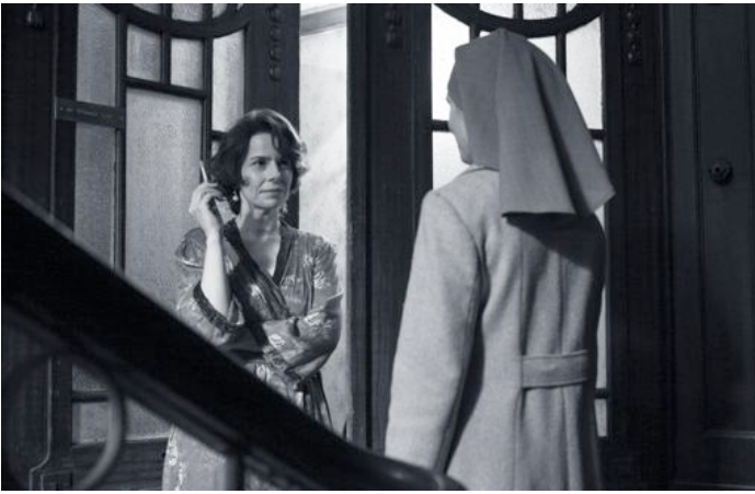
From acclaimed director Pawel Pawlikowski comes Ida , an intimate drama about a young novitiate nun in 1960s Poland who discovers a dark family secret.